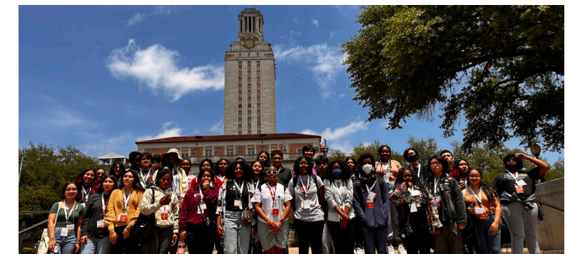
Students enrolled in the College Bound Program on a college tour of the University of Texas at Austin.