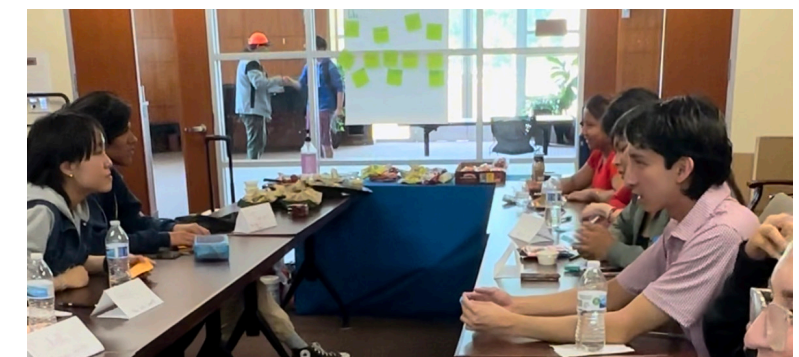
The College Completion Program provides students a chance to reflect and share about their personal priorities before attending college.